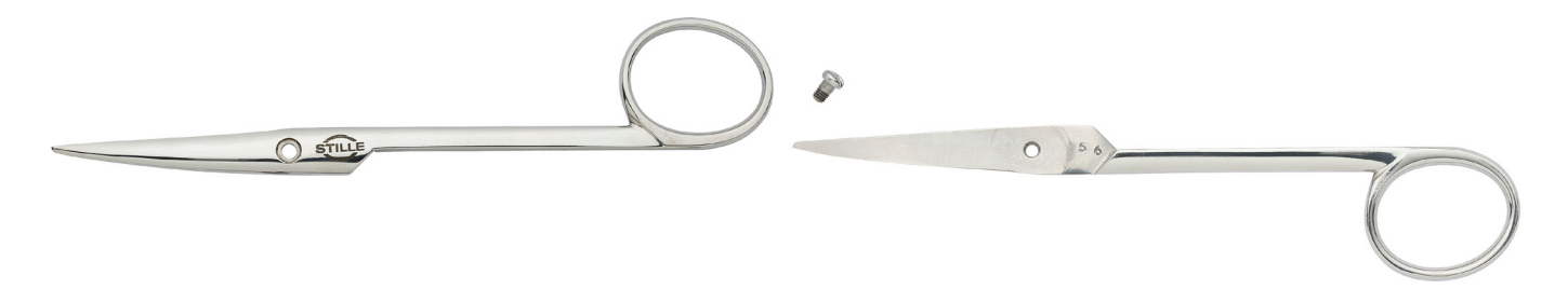
Photo 3: All Stille scissors can be taken apart and realigned at service.