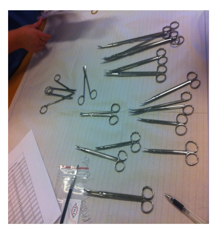
Photo 2: Comparing surgical scissors to their manufacture year code.

On November 12, 2012 at 14:00, 3 sterilization technicians (Gunnel Dahl, Therese Ölveback, Lena Wiklund) inventoried the available scissors at Ersta Diakoni in Sweden (Photo 2).